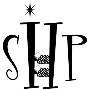
SLEEP IN HEAVENLY PEACE

SHP-OR, Portland Metro invites you to join us for Bunks Across America on SATURDAY, September 14th, 2024 at the Portland Shed. SHP's goal is to build over 8,000 beds with up to 15,000 volunteers, and we need your help to make it happen. So save the date and join us for a memorable day of joy and community service!