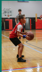
FALL HOT SHOTS