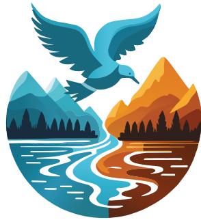
A Mighty River Amos 5:24

portunities to honor, respect, and protect creation in its many forms: