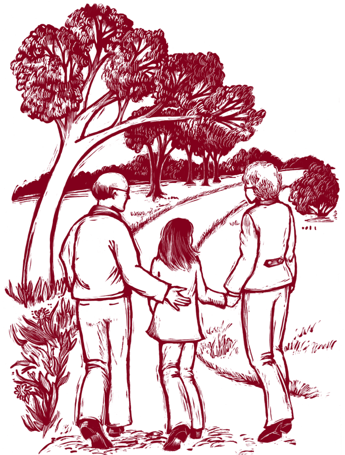
Families can discuss and share ideas on ways to care for creation.

Cutting back on waste is also kind to Mother Earth. Less refuse means smaller landfills. Be rigorous about recycling what you can, including bottles, cans, and paper. Can you give up prepackaged small water bottles in favor of reusable sippers? When you shop, talk about how things are packaged, and consider buying products that have less cardboard or plastic. Are there items you can borrow or rent rather than buy? Or toys and sporting equipment that you can give to others, so that they will buy less?