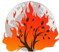
The Burning Bush Ex 3:1-12

We know how to celebrate Advent, observe Lent, rejoice at Easter. But how might we observe the non-liturgical Season of Creation from September 1 through October 4? As a parish, we have planned our liturgies around this beautiful Season when we celebrate all of God’s