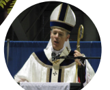
Archbishop Alexander Sample