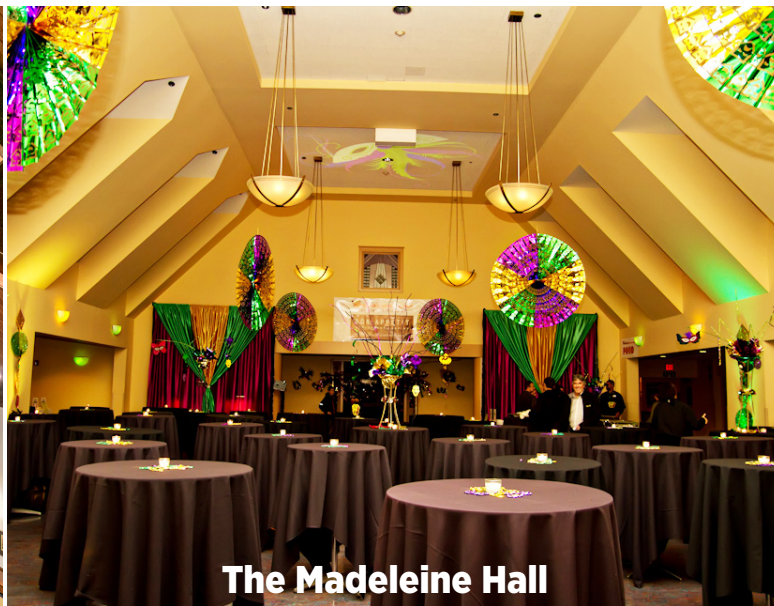
The Madeleine Hall