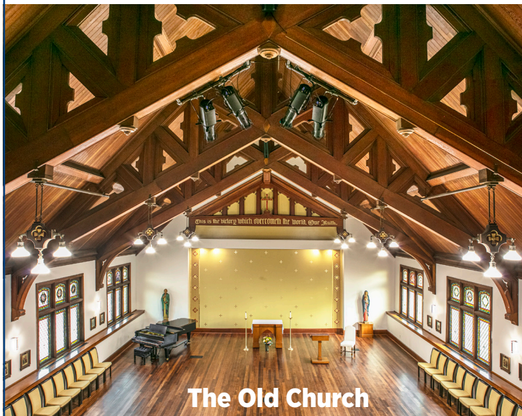
The Old Church