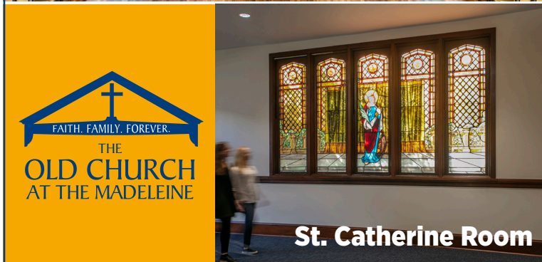
St. Catherine Room