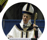
Archbishop Alexander Sample